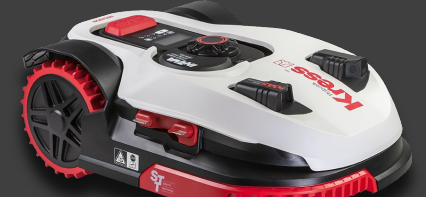
Nano KR101E (€ 1099)